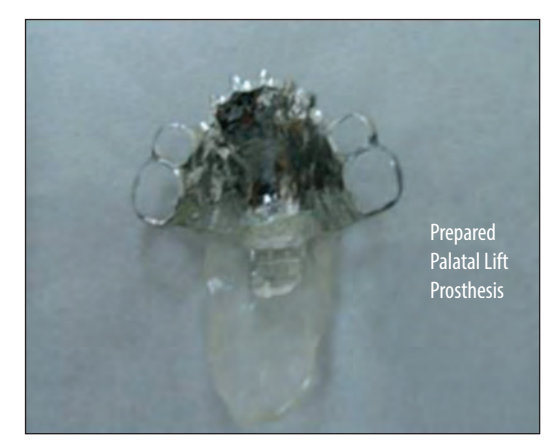
Figure 2 The finished palatal lift before relining.

Patients were evaluated pre-intervention and immediately post insertion, and given appointments for re-evaluation after 48-72 hours of appliance application. The final data of re-evaluation considered in this study was collected after an adaptation period of about two months of appliance insertion. All the study subjects were subjected to auditory perceptual speech evaluation, for assessment of the degree of hypernasality, compensatory articulatory mechanisms, glottal and pharyngeal articulation, audible nasal emission, facial grimace and overall intelligibility of speech. Two simple clinical tests were undertaken for patients i.e., Gutzman's (A/I) test and Czermak's (cold mirror) test. Videonasoendoscopic evaluation was performed for patients using a fiber optic nasofibroscope coupled with high intensity light and recorded using digital Atmos system. Topical anesthetic gel was applied to the nasofibrolaryngoscope before insertion through the nasal cavity, to reach superior to the velopharyngeal port in order to assess movement of the velum, and the lateral and the posterior pharyngeal walls were observed while the patient repeated an oral speech sample, loaded with phonemes, which needed increased oral airflow (plosives and fricatives). Videoendoscopy offers the advantage of a lack of ionizing radiation in videofluroscopy and the ability to help in