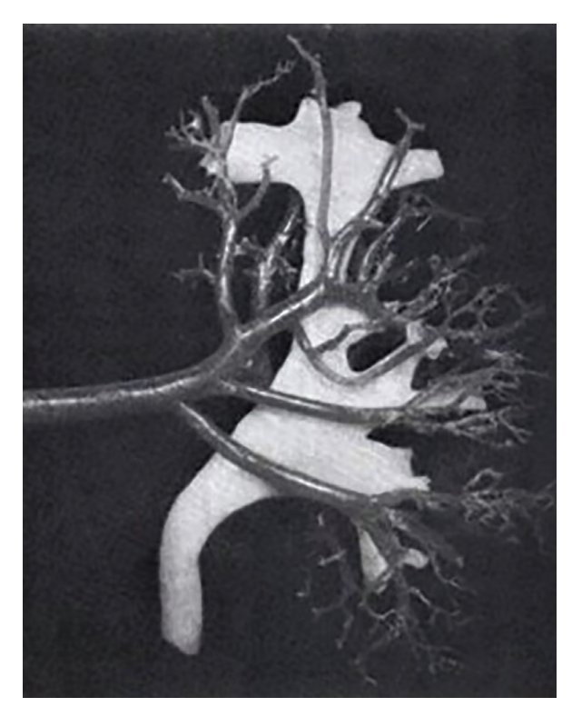
Figure 1. A figure of human kidney's blood supply and collecting system (2).

The kidneys, like the lungs, liver and spleen, have a system of segmental arteries with an essential role in the surgical anatomy of these organs (Figure1). Regarding the intra-renal arteries, their study began using a scientific surgical approach during the last seven decades, even though efforts began in the 17<sup>th</sup> century. Despite the fact that the